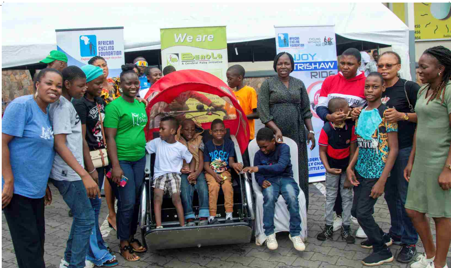
Team Benola (CP Families) at the Launch of a Trishaw project jointly organised by African Cycling Foundation and Benola Cerebral Palsy Initiative to Mark 2023 World Bicycle Day