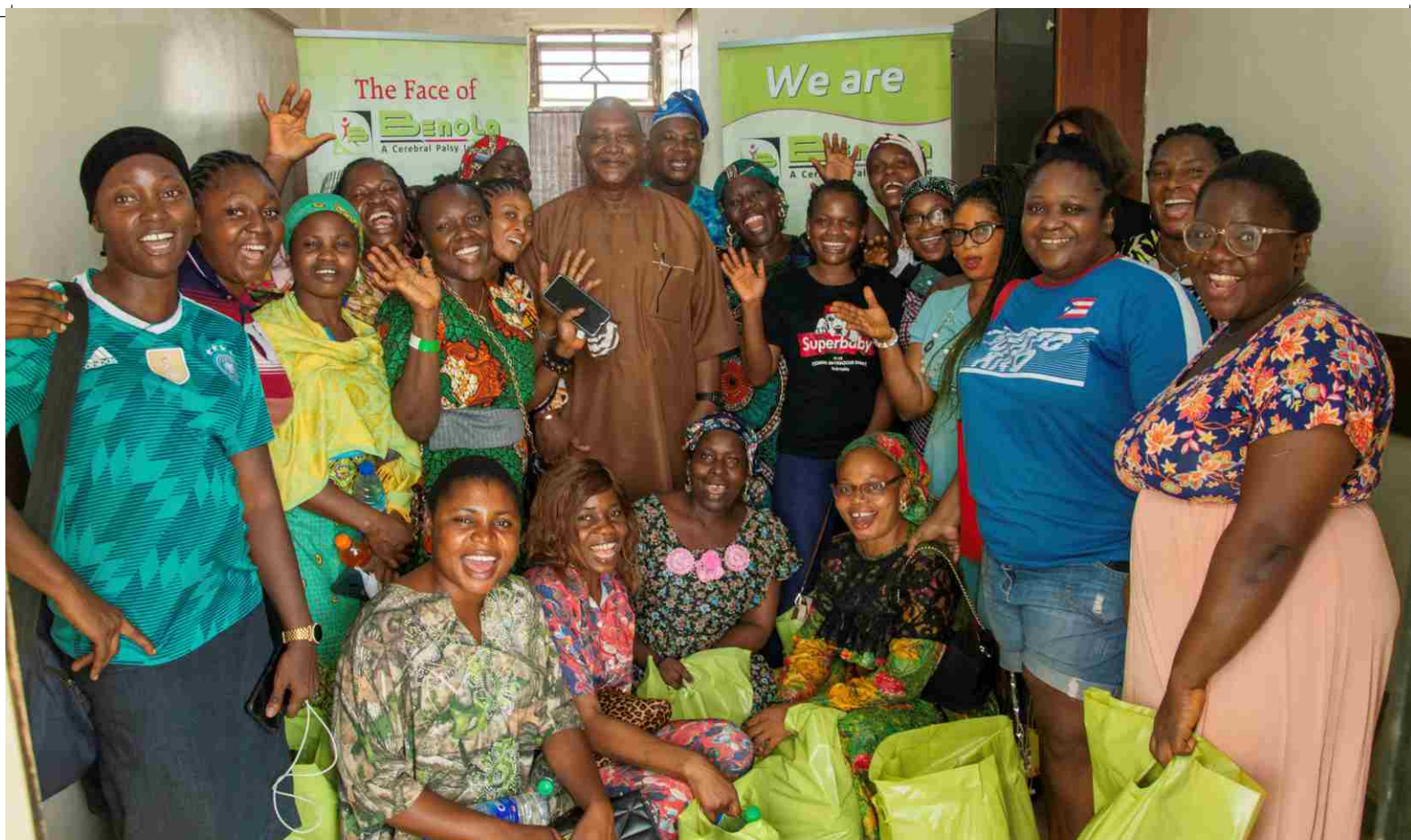
CP Parents at the 2023 Easter Physical Edition of Hangout with the Benola Boss