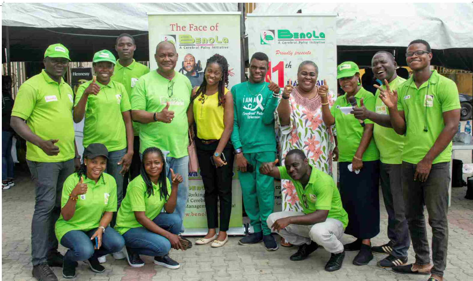
Team Benola (Our Founders, Staff and Volunteers) are the livewire of every Benola Event!